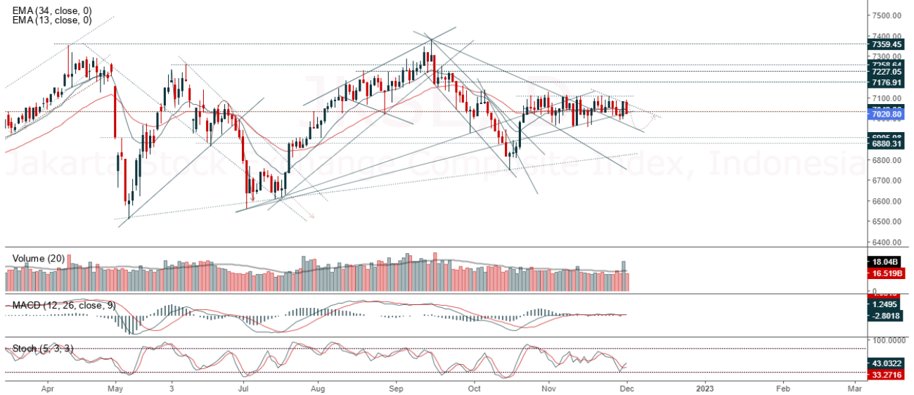
Jakarta Stock Exchange Composite Index, Indonesia, Jakarta:JKSE, D

JCI closed down with a bearish candle and is still in the consolidation area. The stochastic indicator is weakening, the MACD histogram is moving negative (the line is weakening) and volume is increasing again. If JCI is able to move bullish, there is a chance for JCI to strengthen to the resistance at the range of 7,081 – 7,108. If it returns to bearish, JCI is expected to continue weakening to the support at the range of 7,046 – 7,066.