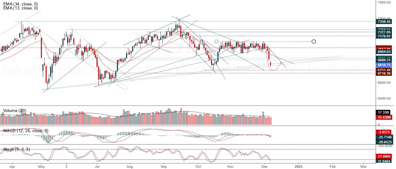
Jakarta Stock Exchange Composite Index, Indonesia, Jakarta:JKSE, D

JCI closed down with a bearish candle. Stochastic indicator is bearish, MACD histogram is moving negative (line is weakening) and volume is decreasing. If it returns to bearish, JCI is expected to continue weakening to the support at the range of 6,736 – 6,747. If JCI is able to move bullish, there is a chance for JCI to strengthen again to the resistance at the range of 6,862 – 6,892.