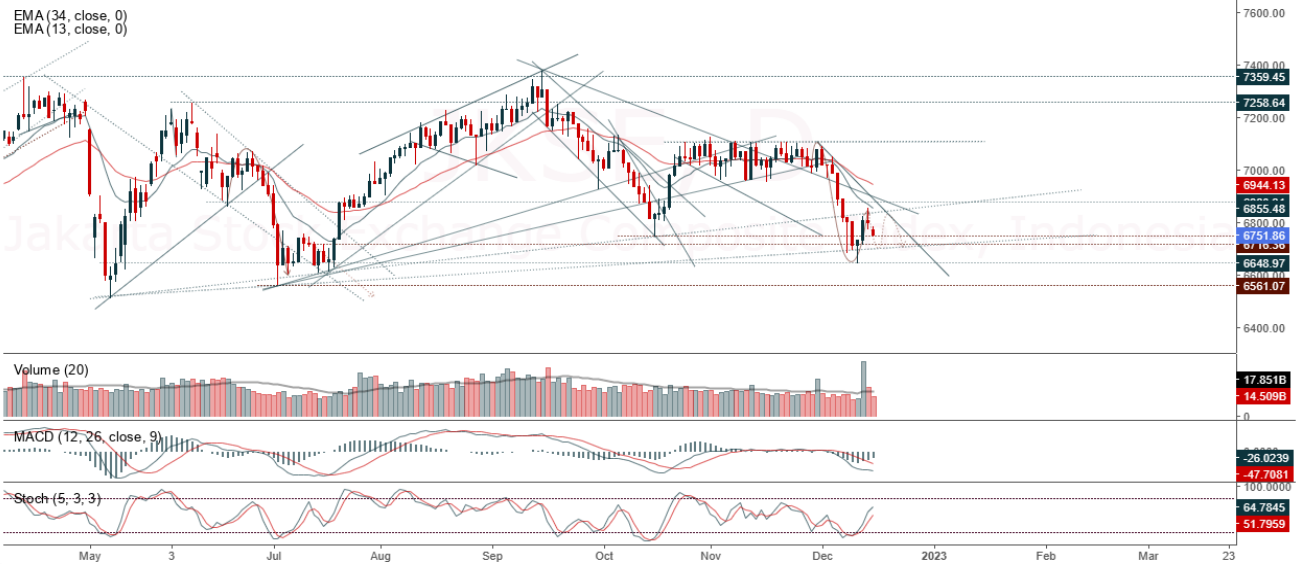
Jakarta Stock Exchange Composite Index, Indonesia, Jakarta:JKSE, D

JCI closed lower with a bearish candle. The stochastic indicator is neutral, MACD histogram is negative, tends to go up (the line is weakening) and volume is increasing. If it returns to bearish, JCI is expected to continue weakening to the support at the range of 6,683 – 6,695. If JCI is able to move bullish, there is a chance for JCI to strengthen to the resistance at the range of 6,801 – 6,826.