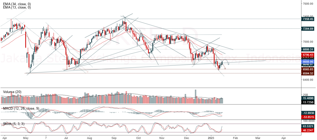
Jakarta Stock Exchange Composite Index, Indonesia, Jakarta:JKSE, D

JCI closed higher with a bullish candle. Stochastic indicator is bullish, MACD histogram is moving negative but in a positive direction (bearish line, slightly sloping) and volume is decreasing. If JCI is able to move bullish, there is a chance for JCI to go to the resistance at the range of 6,726 – 6,747. If it moves bearish, JCI is expected to weaken again to the support at the range of 6,627 – 6,641.