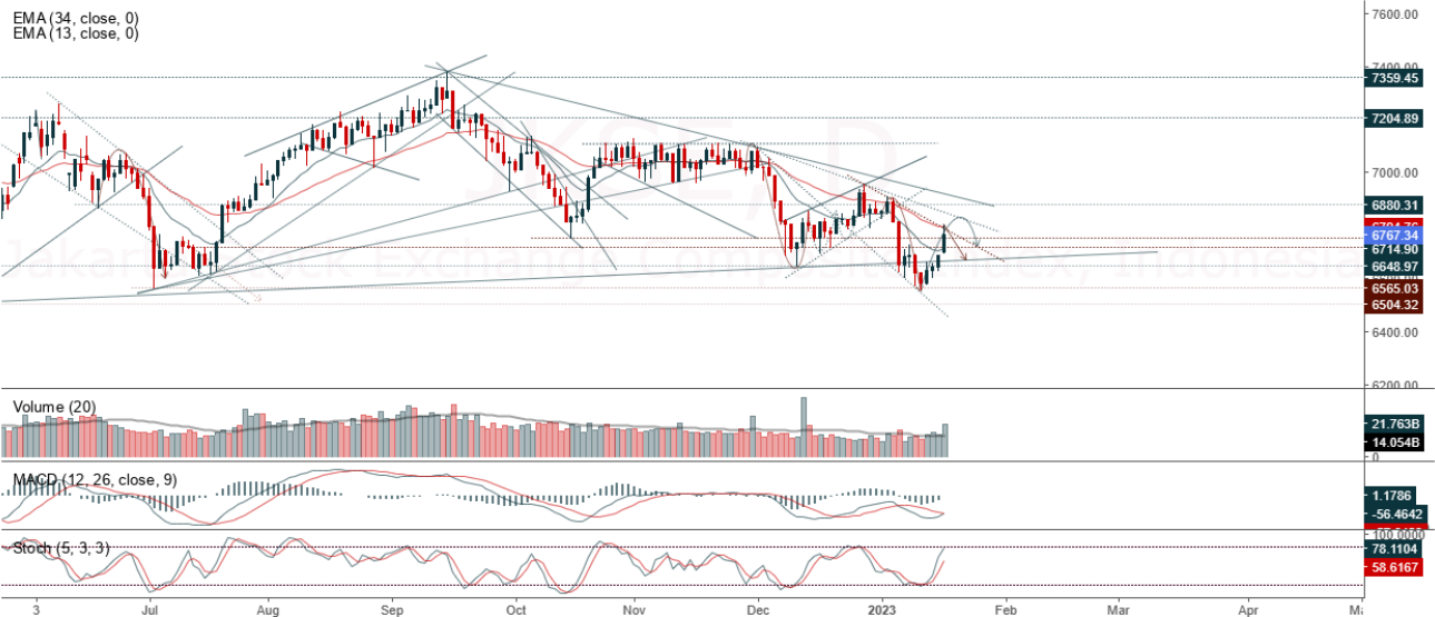
Jakarta Stock Exchange Composite Index, Indonesia, Jakarta:JKSE, D

JCI closed higher and touched the resistance trendline. Stochastic indicator is bullish, MACD histogram is moving positive (golden cross line) and volume is increasing. If JCI is able to move bullish, there is a chance for JCI to go to the resistance at the range of 6,801 – 6,813. If it moves bearish, JCI is expected to weaken again to the support at the range of 6,708 – 6,727.