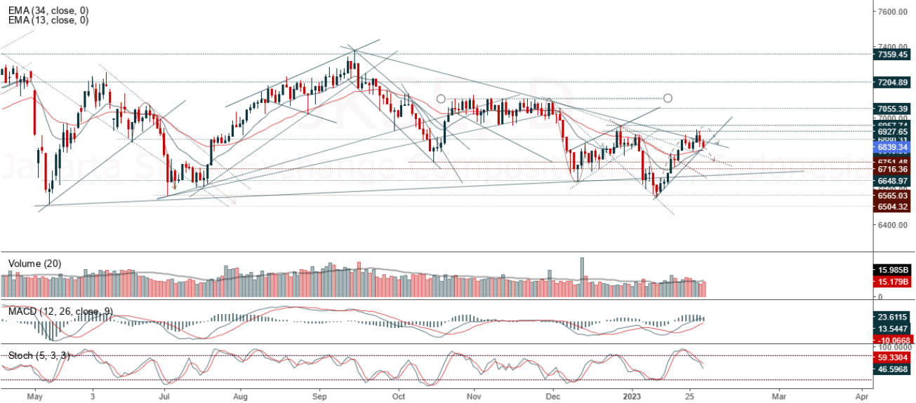
Jakarta Stock Exchange Composite Index, Indonesia, Jakarta:JKSE, D

JCI closed lower with a bearish candle. Stochastic indicator is bearish, MACD histogram is moving positive but down (bullish line) and volume is increasing. If JCI is able to move bullish, there is a chance for JCI to go to the resistance at the range of 6,871 – 6,888. If it moves bearish and breaks down below 6,834, JCI is expected to continue weakening to the support at the range of 6,765 – 6,790.