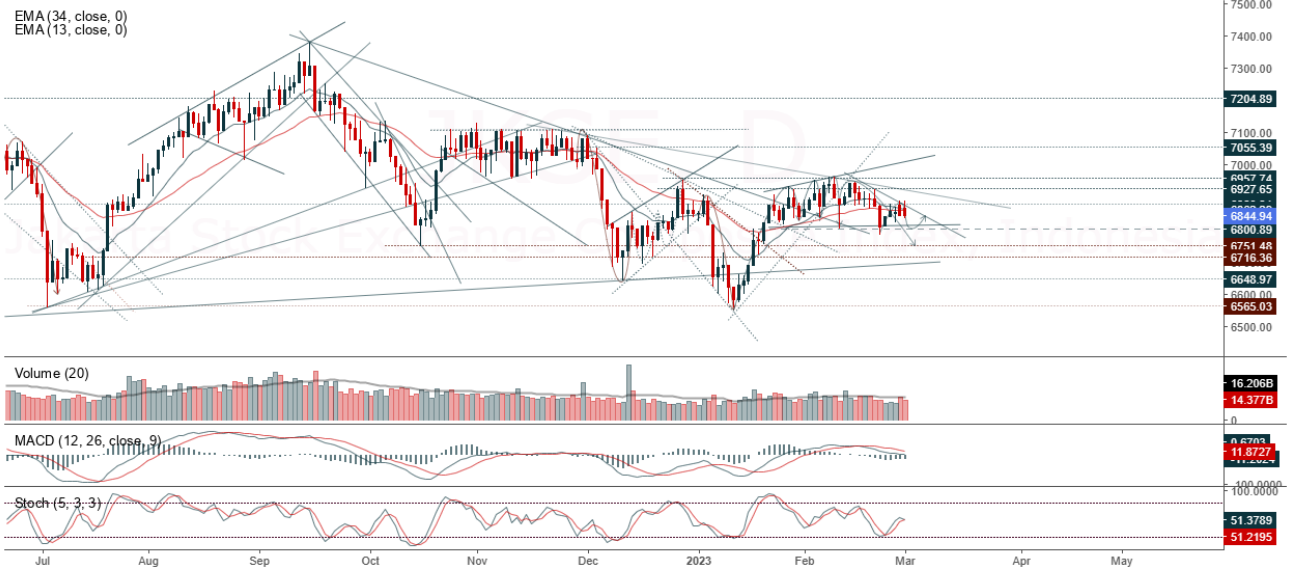
Jakarta Stock Exchange Composite Index, Indonesia, Jakarta:JKSE, D

JCI closed slightly higher. Stochastic indicator is neutral, MACD histogram is negative (bearish line) and volume is decreasing. If it moves bearish, JCI is expected to weaken to the support range of 6,781 – 6,806. If JCI is able to move bullish, there is a chance for JCI to go to the resistance at the range of 6,880 – 6,919.