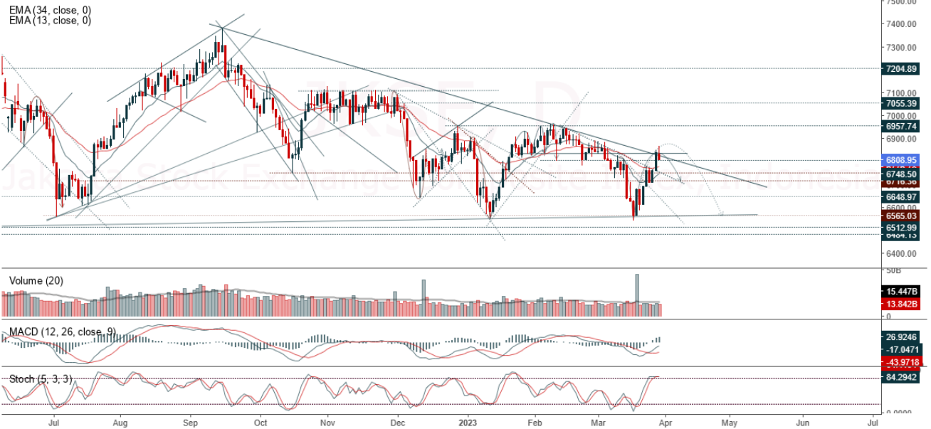
Jakarta Stock Exchange Composite Index, Indonesia, Jakarta:JKSE, D

JCI managed to close down after touching the resistance trendline. The stochastic indicator is weakening, MACD histogram is moving positive (bullish line) and volume is decreasing. If it moves bearish, JCI is expected to weaken to the support range of 6,747 – 6,760. If JCI is able to move bullish, there is a chance for JCI to go to the resistance at the range of 6,851 – 6,868.