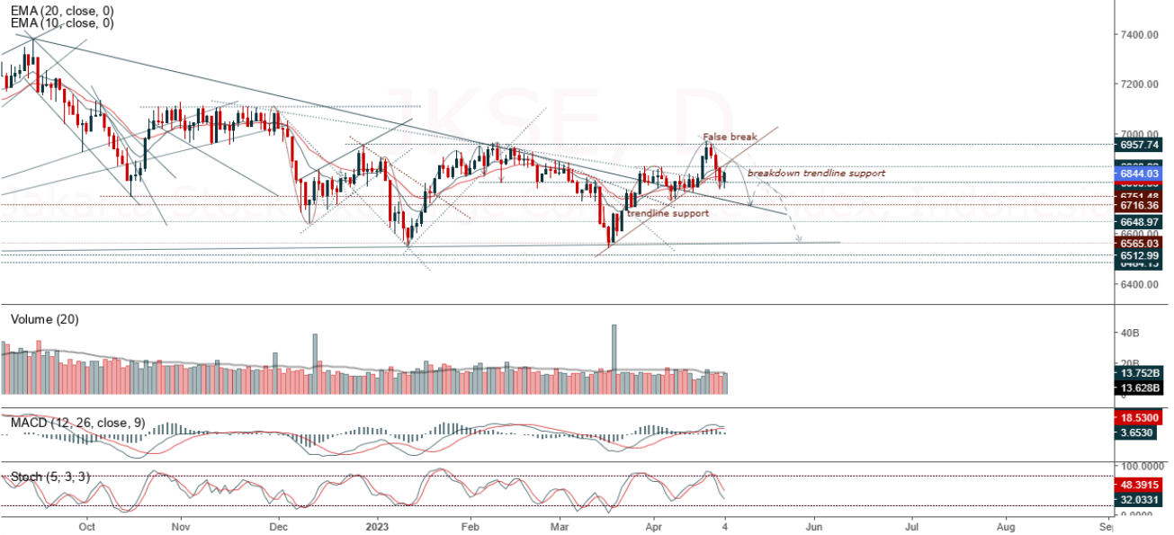
Jakarta Stock Exchange Composite Index, Indonesia, Jakarta:JKSE, D

JCI closed higher with a bullish candle. Stochastic indicator is flat, MACD histogram is moving positive (bullish line) and volume is increasing. If JCI is able to move bullish, there is a chance for JCI to go to the resistance at 6,877 – 6,910. If it moves bearish, JCI is expected to weaken to the support range 6,780 – 6,814.