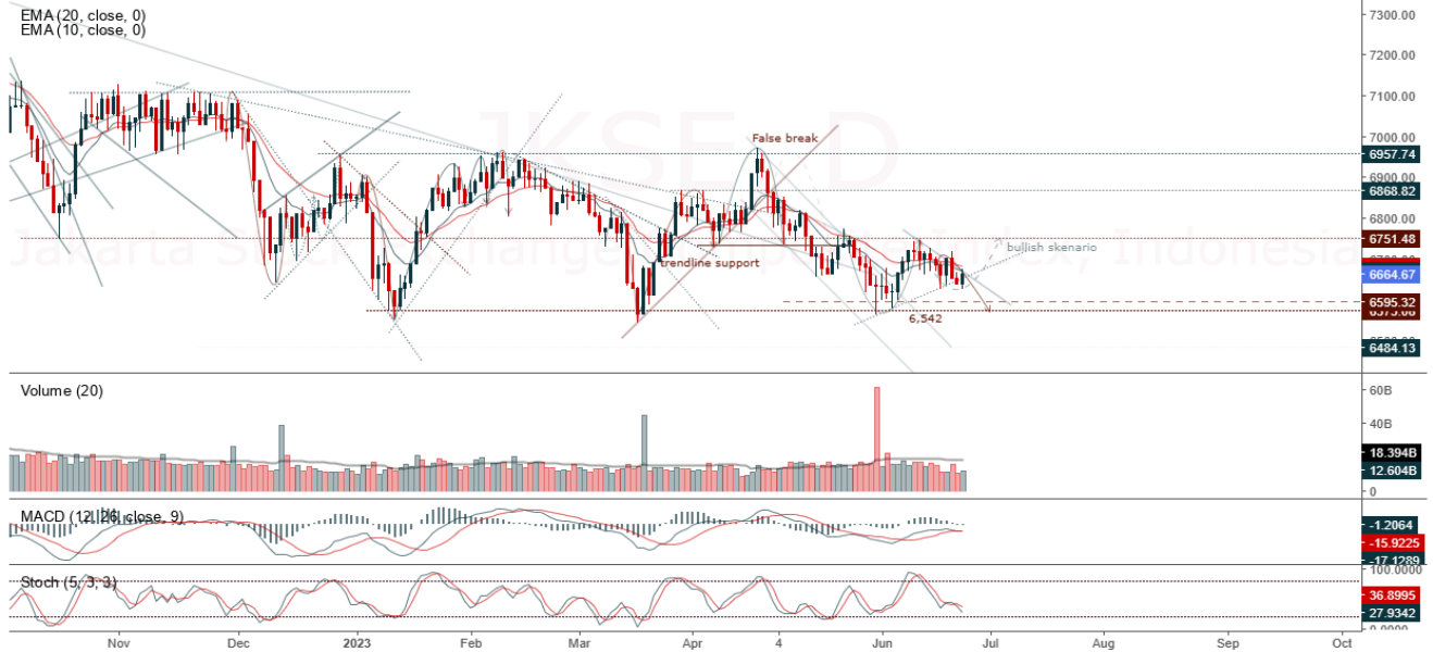
Jakarta Stock Exchange Composite Index, Indonesia, Jakarta:JKSE, D

JCI managed to close higher with a bullish candle. The stochastic indicator is sloping, the MACD histogram is moving positive (the line is weakening) and volume is decreasing. If it moves bearish again, JCI is expected to weaken again to the support range of 6,598 – 6,662. If JCI is able to move bullish, there is a chance for JCI to go to the resistance at the range of 6,702 – 6,717.