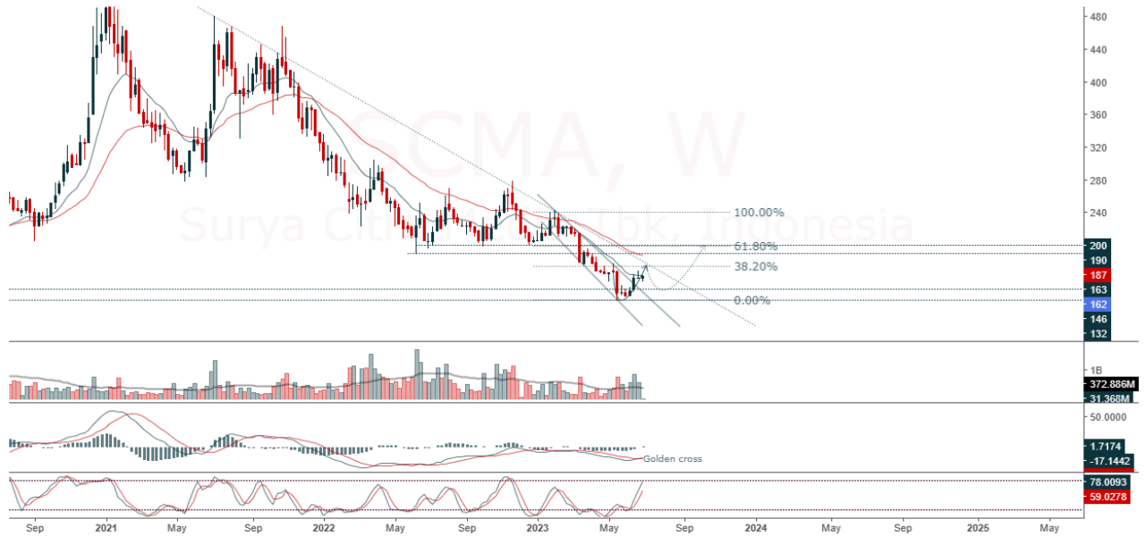
Surya Citra Media Tbk, Indonesia, Jakarta:SCMA, W

(SCMA) The price closed higher with a bullish candle. The price has the opportunity to re-test the nearest resistance. The stochastic indicator has returned to a golden cross potential, MACD histogram is moving positive again (bullish line) and volume is increasing. Confirmation to buy if the next candle is bullish again or buy on support if it goes down first. We suggest being careful if it fails to stay above the support level. (Trading buy)