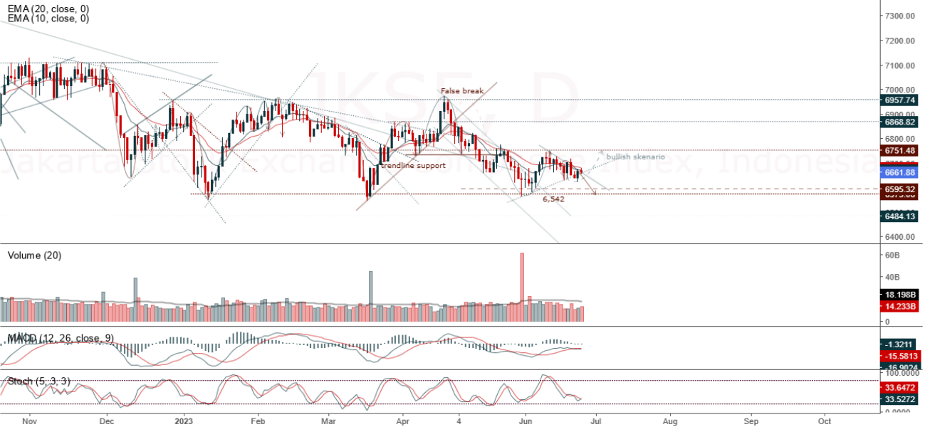
Jakarta Stock Exchange Composite Index, Indonesia, Jakarta:JKSE, D

JCI closed slightly lower with a bearish candle. Stochastic indicator is sloping, MACD histogram is moving positive (sloping line) and volume is increasing. If it moves bearish again, JCI is expected to weaken again to the support range of 6,598 – 6,662. If JCI is able to move bullish, there is a chance for JCI to go to the resistance at the range of 6,702 – 6,717.