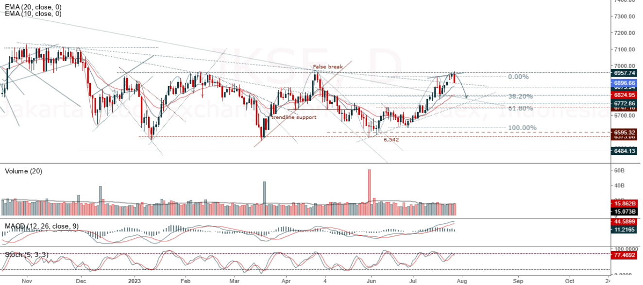
Jakarta Stock Exchange Composite Index, Indonesia, Jakarta:JKSE, D

JCI closed lower and was right at support II yesterday. The stochastic indicator is weakening MACD histogram is moving positive but down (bullish line) and volume is increasing. If it moves bearish again, JCI is expected to weaken again to the support range of 6,838 – 6,863. If JCI is able to move bullish, there is a chance for JCI to go to the resistance at the range of 6,931 – 6,944.