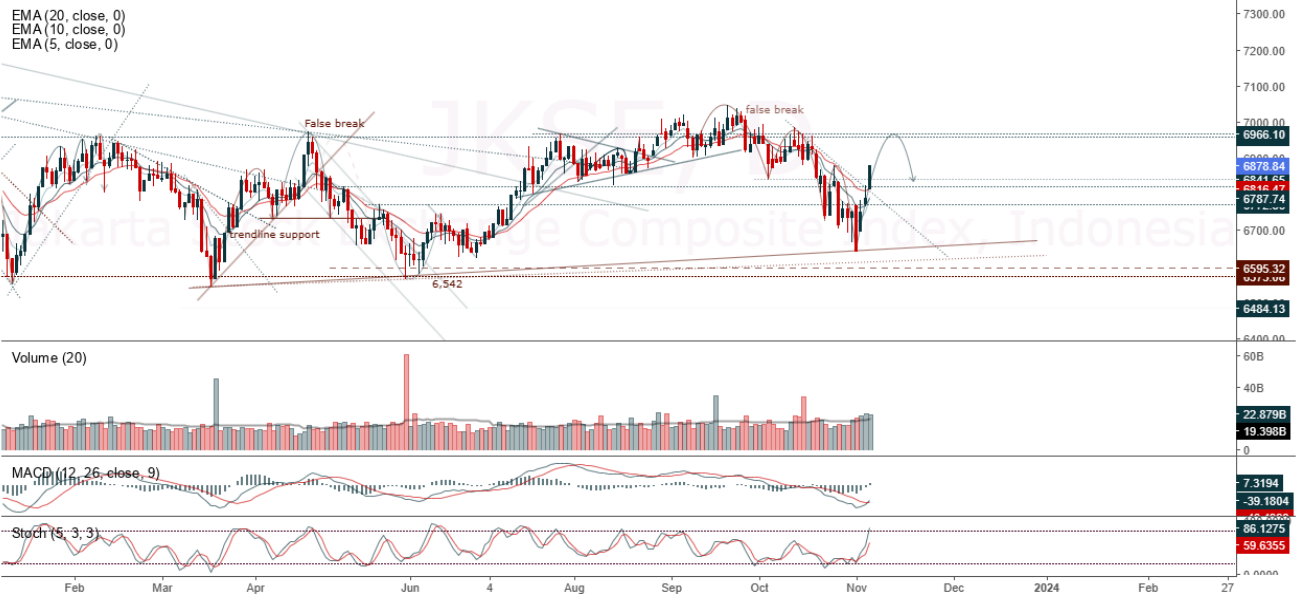
Jakarta Stock Exchange Composite Index, Indonesia, Jakarta:JKSE, D

Jakarta Composite Index , JCI closed higher to the nearest resistance. The short-term index is back in uptrend. Indicator from stochastic is bullish, MACD histogram is moving positive (line is golden cross) and volume is increasing. Bearish scenario: If it moves bearish again, JCI is expected to weaken again to the support range of 6,787 – 6,826. Bullish scenario: If JCI is able to move bullish, JCI has a chance to reach resistance 6,948 – 6,968.