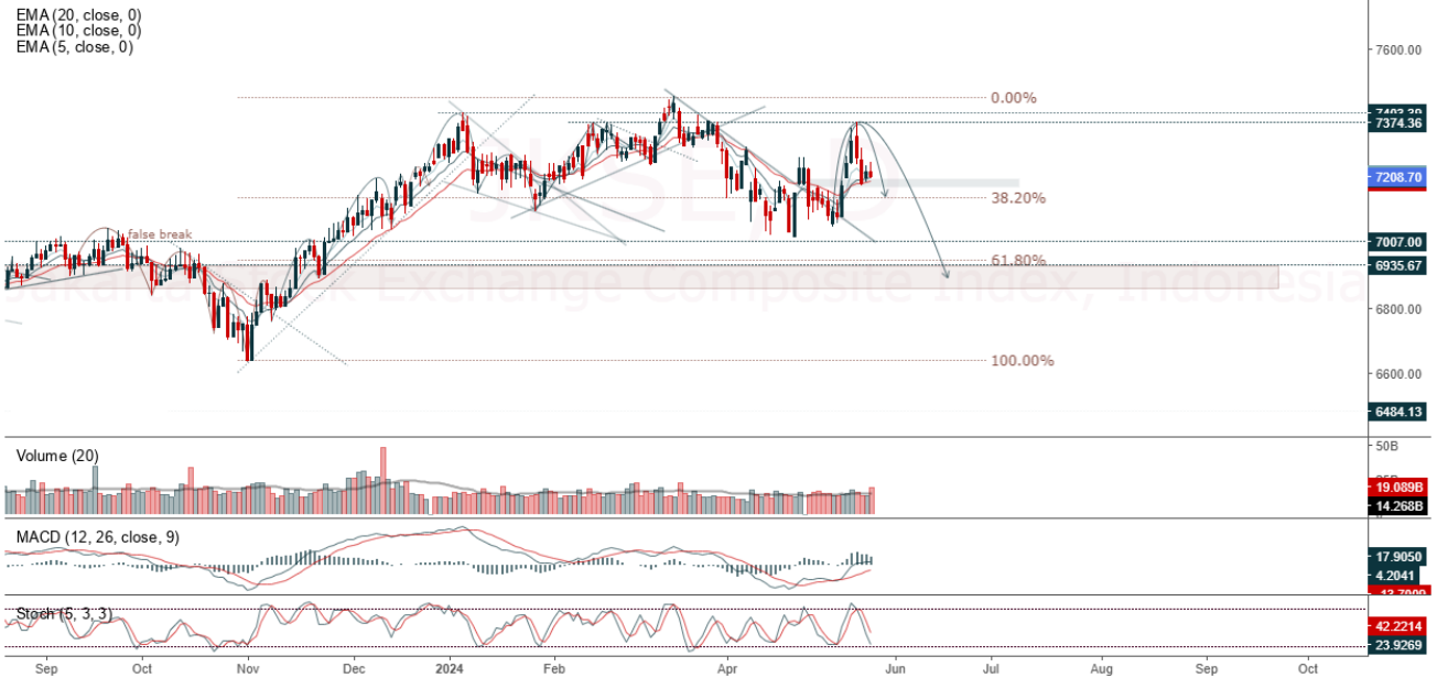
Jakarta Stock Exchange Composite Index, Indonesia, Jakarta:JKSE, D

Jakarta Composite Index , Price closed negative and testing support. Indicator from stochastic is still bearish, MACD histogram is moving positive (line is sloping) and volume is increasing. Bearish scenario: If it moves bearish again, JCI is expected to weaken again to the support range of 7,081 – 7,111. Bullish scenario: If JCI is able to move bullish, JCI has the opportunity to break resistance 7,239 – 7,256.