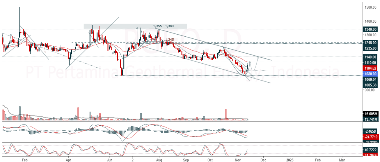
PT Pertamina Geothermal Energy, Indonesia, Jakarta:PGEO, D

(PGEO). Price closed higher and breakup trendline resistance. Price has the opportunity strengthen to the nearest resistance. Stochastic is still bullish, MACD histogram is moving positive direction (line is golden cross potential) and volume is increasing. Confirm buy if the next candle returns bullish or buy on support if it goes down first. Be careful if you fail to stay above the support level or become a support breakdown. (Trading Buy)